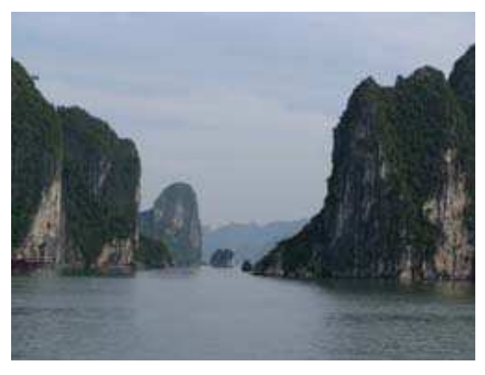
Elaboración propia. Derechos cedidos