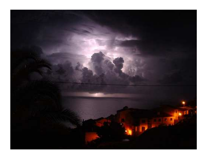
By Madeira. C. Commons